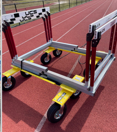
Track & Field